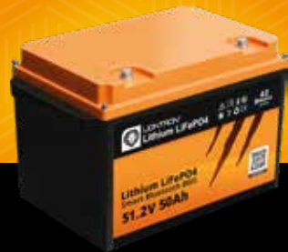
LIONTRON® LX Smart 51.2 V 50 Ah

Capacity: 50 Ah / 2560 Wh Charging voltage: 41.2 - 57.6 V Max discharge current (continuous / peak): 50 A Integr. BMS / Bluetooth: Yes / Yes Dimensions (L x W x H): 390 x 232 x 257 mm Weight: 35.9 kg