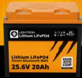
LIONTRON® LX Smart 25.6 V 20 Ah

Capacity: 20 Ah / 512 Wh Charging voltage: 28.8 V Max discharge current (continuous / peak): 20 / 40 A Integr. BMS / Bluetooth: Yes / Yes Dimensions (L x W x H): 198 x 152 x 170 mm Weight: 5.7 kg