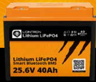
LIONTRON® LX Smart 25.6 V 40 Ah

Capacity: 40 Ah / 1024 Wh Charging voltage: 28.8 V Max discharge current (continuous / peak): 40 / 80 A Integr. BMS / Bluetooth: Yes / Yes Dimensions (L x W x H): 260 x 168 x 209 mm Weight: 9.7 kg