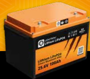
LIONTRON® LX Smart 25.6 V 100 Ah

Capacity: 100 Ah / 2560 Wh Charging voltage: 28.8 V Max discharge current (continuous / peak): 150 / 200 A Integr. BMS / Bluetooth: Yes / Yes Dimensions (L x W x H): 390 x 232 x 257 mm Weight: 27.7 kg